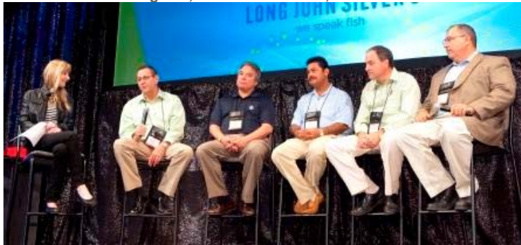
Franchise leaders share how they are driving World Class Operations in their organizations.